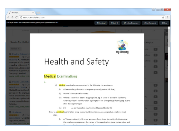
View relevant, highlighted content inside a document