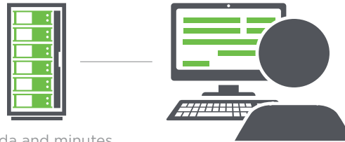
Agenda and minutes software